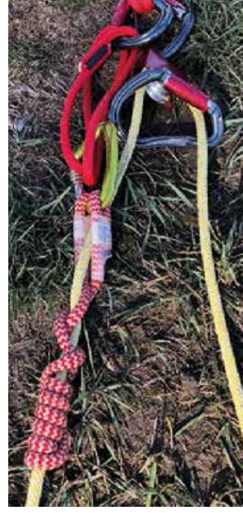
Fig 2. Valdotain Tresse VT Prusik on TEC We now can have a single rope REEP low angle system, being changed that can be used for throwlines over with optional karabiner below pulley across both ropes to assist with Prusik minding during haul. In this photo the 80cm Tendon Timber Prusik was used, however the author recommends using the 100 for Rescue in 2019, concluded or 120cm variant instead to remove the additional off-set prusik sling as illustrated.

Finally, adding to the mix, is the VT Prusik (Fig2). This was developed primarily for arborists as an ascending hitch with a sewn eye at each end but has gained popularity among those using micro-rope systems such as in tactical and certain mountain rope operations. The VT Prusiks, like the TEC REEP cord have a heat resistant Aramid fibre sheath allowing them to be used in high friction situations traditionally not suited to nylon prusiks. It is the combination of these new ropes that allow for us to completely rethink what ropes we use for swiftwater rescue. and rope rescue systems in the swiftwater environment. Testing carried out by Rigging that the "VT Prusik appeared to be a superior alternative to