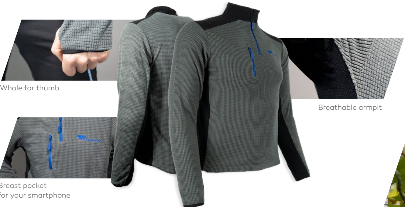
Whole for thumb