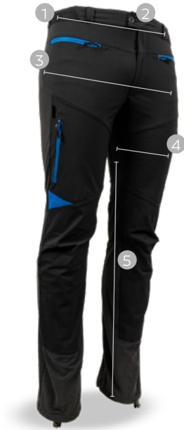
Way up light pants - size chart*

Clothing for work is often worn eight, then or twelve hours a day, which is why the size should not be left to chance. The size table for our clothing helps you find the right sizes for your perfect fit.