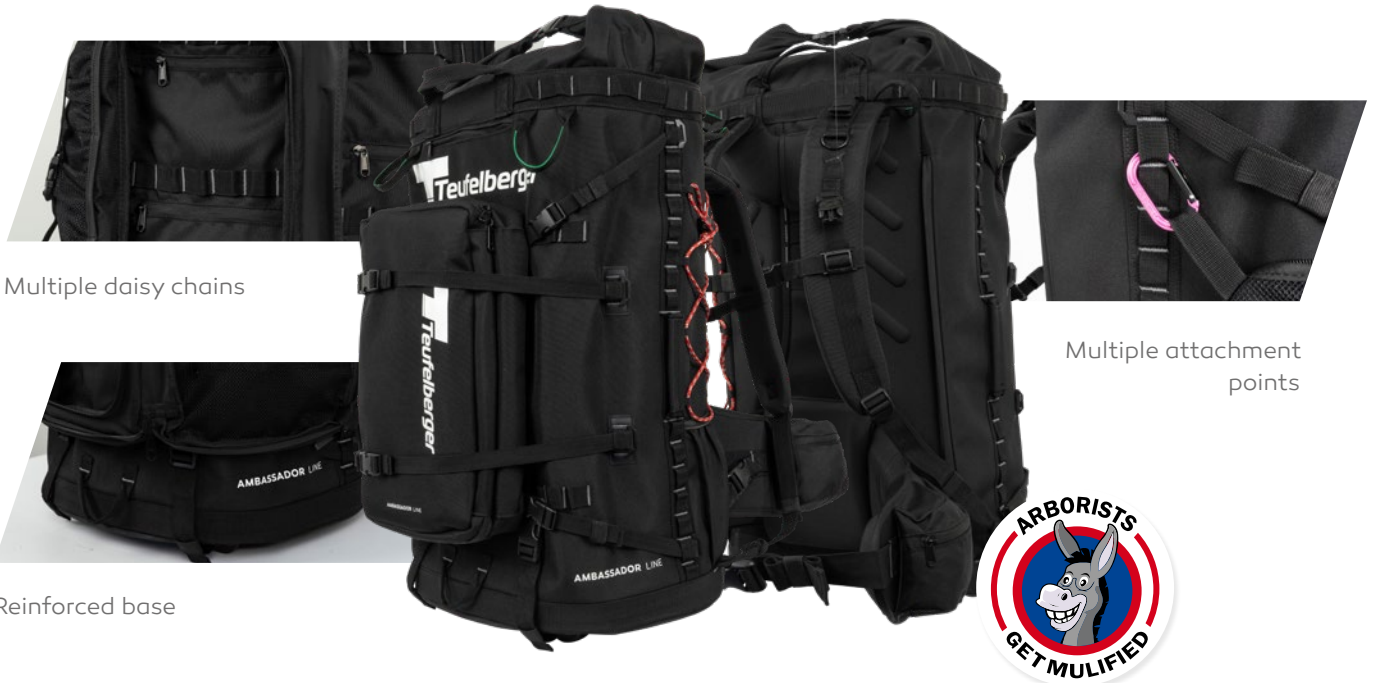
Multiple daisy chains

H= 65 cm, P= 120 cm, 80L Excluding Apron: H= 25 cm