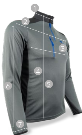
Fresh swell long shirt - size chart*