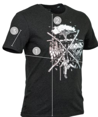
tSPIRIT - size chart*