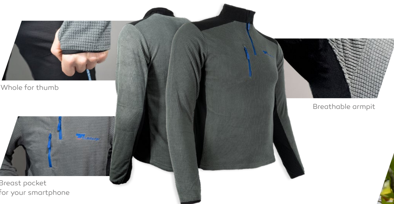
Whole for thumb